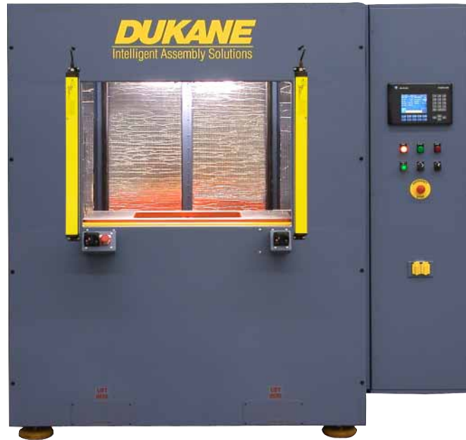
Table Size 38" (965mm) by 18" (455mm)